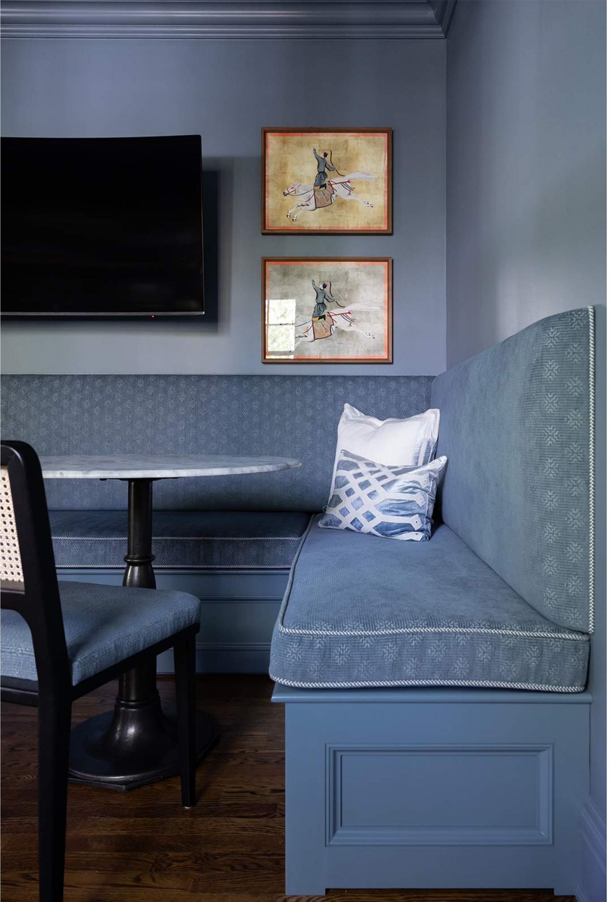
A Chinese warrior practises horse riding to keep his skills sharp.