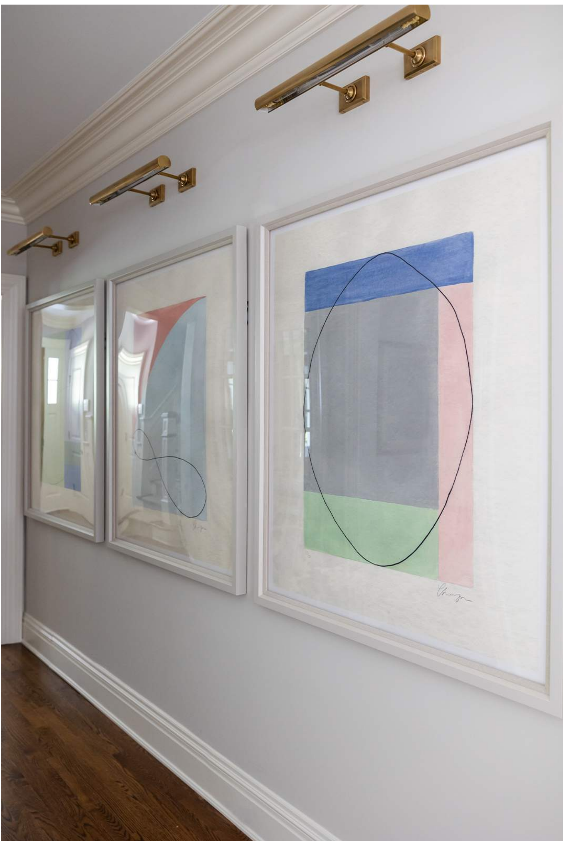
Simple shapely line drawings are accentuated by soft colours.