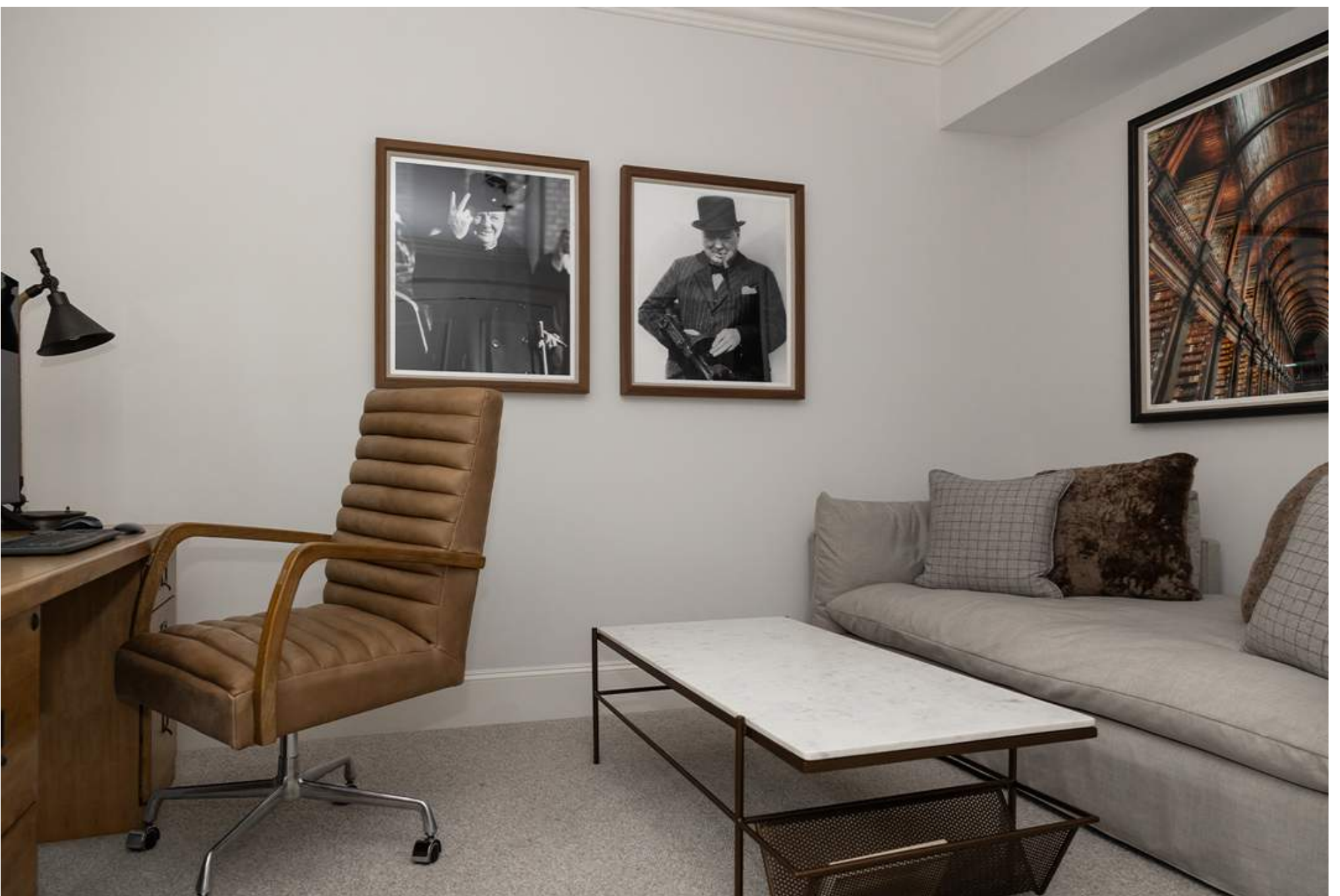
Sir Winston Churchill makes his famous V for Victory sign as he emerges from a cabinet meeting.

CLICK HERE TO SEE V FOR VICTORY FROM THE TROWBRIDGE BLACK & WHITE PHOTOGRAPHY