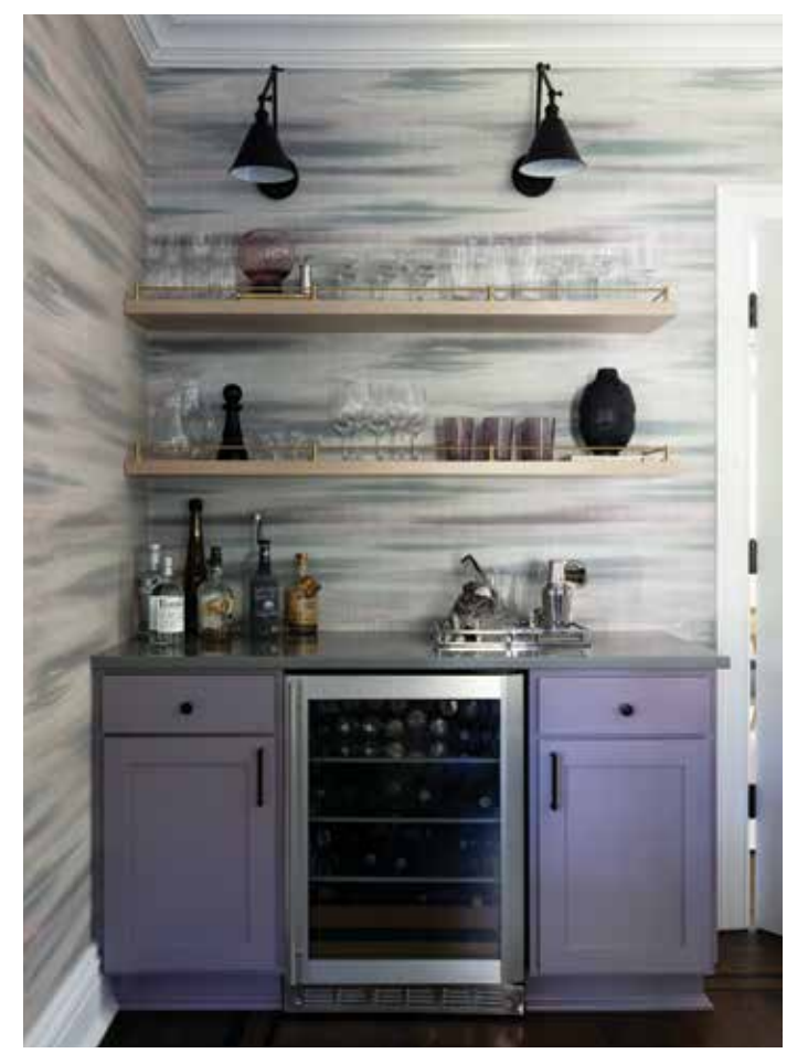
ABOVE: Grasscloth wallcovering and silk curtains bring texture to the living room. The chandelier of mirrored discs from Arteriors adds a playful note. LEFT: An island from the original kitchen, fitted with a beverage refrigerator, is repurposed as a bar in a corner of the room.

or a couple with three boys under seven, moving from a New York City apartment to a house in suburban Connecticut was an opportunity to create a home tailored to their needs. "The house had good bones," says the owner of the 4,900-square-foot, six-bedroom traditional-style structure set on a bucolic half acre, but to work for her active family it needed an update. "I wanted to modernize while respecting the classic architecture," she says.