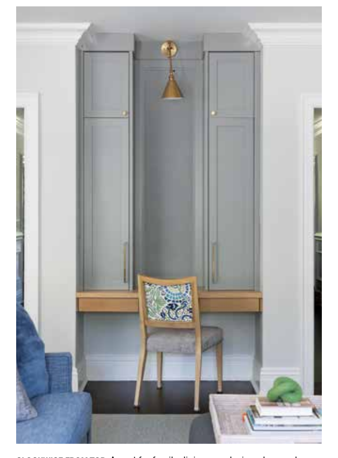
CLOCKWISE FROM TOP: A spot for family dining was designed around a banquette on one side of the new island; the table base is from Dunes and Duchess, and the top was custom made by builder Palette Pro Painting & Renovation. A nook in the family room, command central for children's activities, has a corkboard for notes and cupboards for storage. The banquette is upholstered in performance vinyl from Kravet, and floral arrangements are by Abilis Gardens & Gifts in Greenwich.