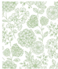
Green Floral Wallpaper

We love this elegant vanity stool, armed with iron legs and a velvety, sage cushion.