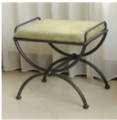
Iron Vanity Stool with Sage Cushion